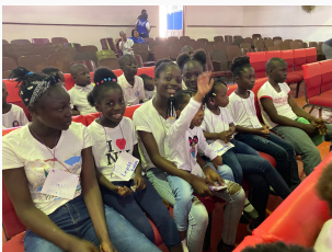
Christmas activity at Buenas Nuevas Church