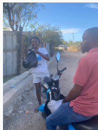
Community Help: Food bags

Is to present the love of Jesus Christ to the children, families and community by establishing programs to teach the Word of God, academics training, and job skills development.