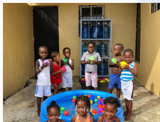
Water play day