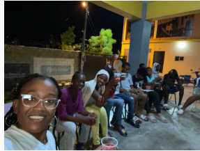
Youths in the Word